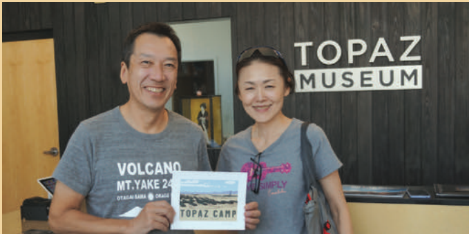
A couple from Nara edged out the family from the Netherlands on being the visitors who traveled the farthest to come to the museum.

the program. Several props and artifacts related to traditional dance from Ms. Tachibana’s personal collection, which were displayed and discussed, were donated to the Topaz Museum.