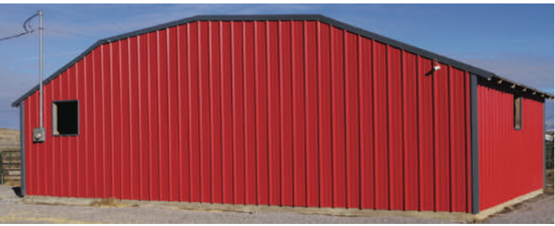
The mess hall sat empty for many years after it was moved from Topaz. Now Chad Warnick’s Ag classes use it for part of their curriculum.