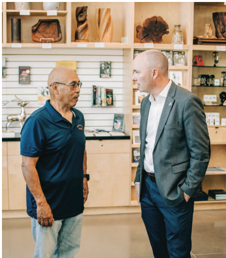
Governor Spencer Cox came to the museum after he signed the Day of Remembrance legislation. Max Matsuhara just happened to be at the museum that day.

nese Americans is relevant today—especially today—and must never, ever, be forgotten,” said Senator Jani Iwamoto. Three months later, Governor Cox visited the Topaz Museum on May 23, 2022 and tweeted this message: “The Topaz Museum memorializes one of the uglier episodes in American history. More than 11,000 people of Japanese descent spent time in this internment camp between 1942 and 1945. We must never allow hate and prejudice to lead to this kind of violation of human rights again.”